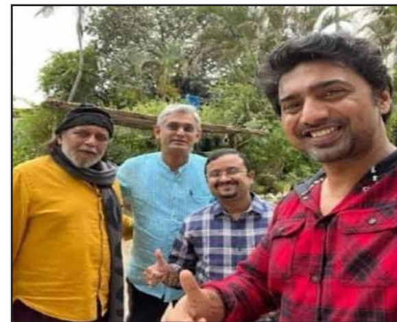
Dev -Mithun Charkborty together on screen again, shooting of 'Prajapati' starts in Bidhannagar. July 5, 2022.

at 2.3 lakh whereas there are allowances also on accommodation if it is not provided by the government. The respective salaries of MLAs in Andhra Pradesh, Tamil Nadu, Uttarakhand, Chhatisgarh, Mizoram and West Bengal stand at 25,000, 1.5 lakh, 30,000, 25,000, 40,000 and 4,000, respectively. Chhatisgarh lawmakers get allowances like orderly allowance to the tune of 15,000, medical allowance of 10,000. Thus, the cumulative salaries of Uttarakhand MLAs is over 1.82 lakh while those of the AAP ruled Punjab is near 95,000. The Mizoram MLAs draw close to 1.50 lakh. Delhi MLAs have raised the issue of low salary several times in the past with Vishesh Ravi even saying in 2018 that unmarried MLAs find it difficult to find brides. Chief Minister Arvind Kejriwal had said that their is an honest government and their MLAs do not indulge in corruption. Salaries and allowances of Delhi MLAs were last increased in 2011. The monthly salary of an MLA in Delhi was 12,000 but after the bill, which will go for President's approval, it will be 30,000.