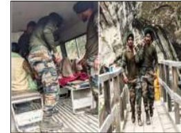
Yatrists in Paddar region of Kishtwar, the soldiers who were part of patrol were alerted by cries for help from a distance. CONTINUED ON ► PAGE 10

Jammu: The troops of RR (MARATHA LI) on Tuesday saved the life of two elderly women when they were on a pilgrimage to Chitto Mata Yatra in Paddar region of Kishtwar District. The troops of 17 Rashtriya Rifles (MARATHA LI) from Kijai COB were providing prophylactic security to Chitto Mata