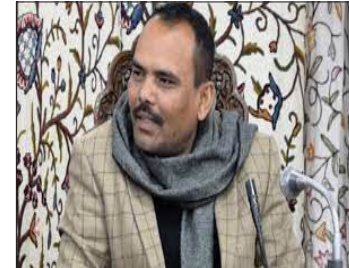
ments, Div Com directed Deputy Commissioner Srinagar and officers of Sheep Husbandry and Animal Husbandry departments to ensure availability of sufficient numbers of sacrificial animals to

loaded vehicles through NH44 so that the trucks carrying essential and perishable products are given priority to ply on NH44. They were asked to contact Whatsapp number-9469807526 of the Divisional Traffic Control Room established for diversion of vehicles through NH44. "The Div Com directed that all Oil and LPG tankers besides FCI empty vehicles shall ply through Mughal Road. Moreover, he directed that drivers of all eight to ten tyre loaded vehicles shall ensure movement through Mughal road. While reviewing Eid arrange-