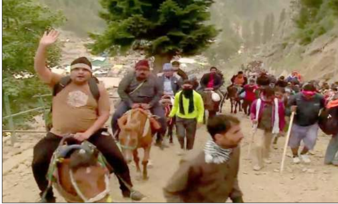
the Ramban district. Pahalgam is about 90 km from Srinagar, the Jammu and Kashmir capital.

Srinagar, July 5: The Amarnath Yatra, which began last week, was temporarily suspended from the Pahalgam route on this morning amid bad weather. The annual 43-day pilgrimage is held from the twin base camps - Nunwan in Pahalgam of south Kashmir's Anantnag and Baltal camp in central Kashmir's Ganderbal district. Around 3,000 pilgrims were stopped at the Nunwan base camp on the Pahalgam axis this morning, officials said. Another batch of around 4,000 pilgrims that left Jammu for the Pahalgam route were stopped at Yatri Niwas in Chanderkote in