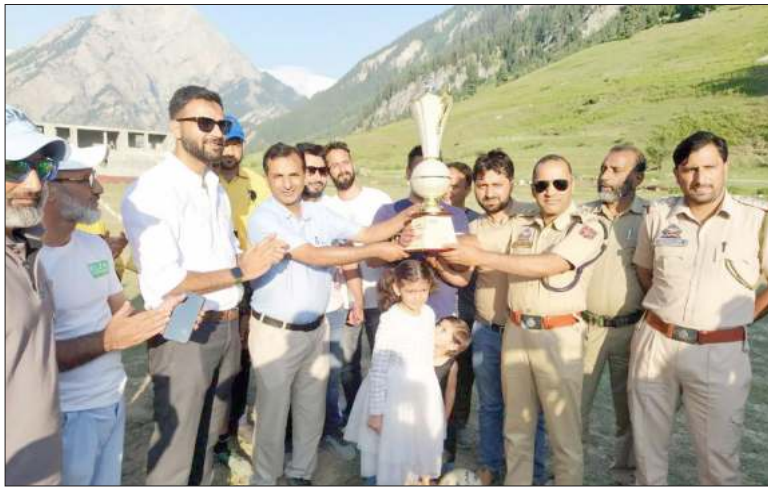
healthcare programs in the area. The ADDC said in his speech

The people appreciated the efforts of district administration and ELFA International for making the event possible and also asked the ELFA International to continue such events in future too. The people also hailed the ELFA International for its tireless efforts in the field of humanitarian sector and requested the organisation to extend its educational and