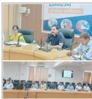
While discussing the engagement of Implementation of Support Agencies (ISAs), the

The DC asked for making district level water testing labs functional to ensure supply of safe drinking water through close monitoring and surveillance.