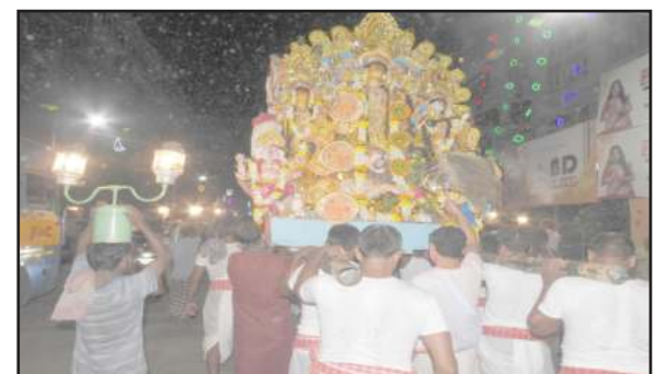
On way to Immersion, Kolkata. Oct 5, 2022.

Ms Braverman was referencing the Migration and Mobility Partnership (MMP) clinched between her predecessor in the Home Office, India-origin former Home Secretary Priti Patel, and External Affairs Minister S Jaishankar in May last year. "This landmark agreement with our close partners in the government of India will provide new opportunities to thousands of young people in the UK and India seeking to live, work and experience each other's cultures. This agreement will also ensure.