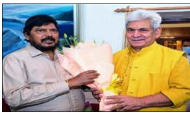
Union MoS, Member Parliament meet Lt Governor

SRINAGAR, OCTOBER 06: Dr. Ramdas Athawale, Union Minister of State for Social Justice and Em