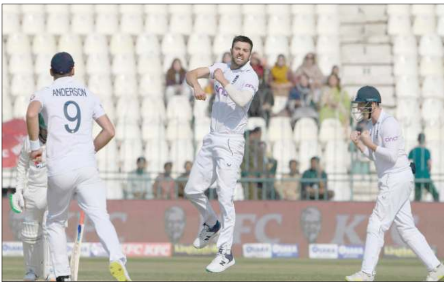
day of the second cricket Test match between Pakistan and England at the Multan Cricket Stadium in Multan on December 12. — But James Anderson had Ahmed caught, Wood

Pakistan's Zahid Mahmood clean bowled by England's Mark Wood (not pictured) during the fourth