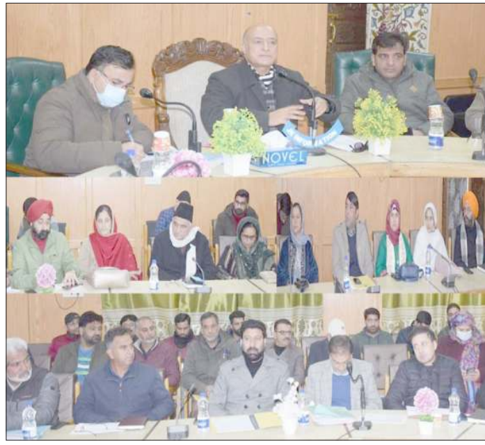
a proactive role so that all the necessities are completed well within the stipulated time. Moreover, he directed to hold gram sabhas adding that all the

On the occasion, a comprehensive discussion was held where in the chairperson stressed for ensuring public participation while formulating development plans at grassroots level. He emphasized upon the PRIs to play