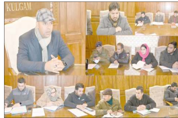
years. He called upon all concerned departments to saturate the remaining Aadhaar Enrolment in the district besides launching mass awareness campaigns in their jurisdictions to cover all population under Aadhaar enrolment.

The DC asked the concerned to start intensified Aadhaar enrolment drives for children below 5 years and to get Mandatory Biometric updates (MBU) done on attaining the age of 5 years and 15