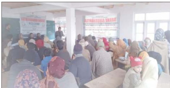
micro food processing enterprises.

The programme was conducted in different blocks of district viz. Beerwah, Chadoora, Khanshab, Narbal and Budgam with the aim to create awareness among the public regarding 'PM-Formalization of Micro food processing Enterprises' scheme' launched by Ministry of Food Processing Industries (MOFPI), in partnership with the State/ UT Governments, for providing financial, technical and business support for new or up-gradation of already existing