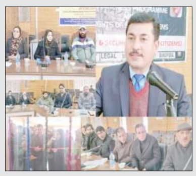
including parents and senior citizens along with remedial measures within the mandate of this Act. Earlier, Secretary DLSA delivered a welcome address and highlighted

He said that senior citizens are increasingly facing a variety of hardships in day to day life with respect to their basic life requirements including food, shelter, clothes, health problems, financial problems etc., mostly due to negligence and ill treatment of their children. He advised the Judicial Officers, Advocates and PLVs to address the basic issues of elderly population