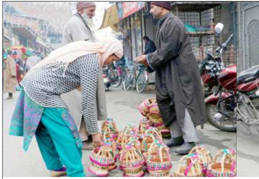
A man sells fire pots (Kaangir) on a cold day in Srinagar on Monday.

Srinagar, Dec 5 Srinagar, the summer capital of Jammu and Kashmir, recorded the coldest night of the season on Monday at minus 3.4 degree Celsius. The minimum temperature continues to settle below freezing point in the Valley as majority of stations recorded sub-zero temperature. News agency Kashmir News Observer (KNO) reported that the minimum temperature at world famous ski-resort, Gulmarg was recorded at minus 3.2 Degree Celsius last night while Kupwara in north Kashmir recorded a temperature of minus 2.7 Degree Celsius.