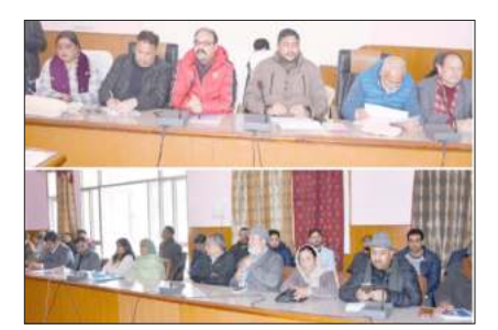
works and holistic development of the district and asked them to work with utmost dedication in taking the district forward in developmental front.

He also directed them to make endeavours aimed to ensure prompt execution of