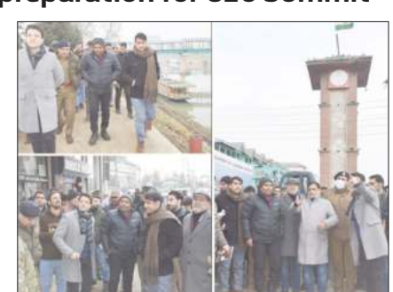
hance the facade of roads through development of foot paths, medians, traffic CONTINUED ON → PAGE 07

At the outset, Div Com Kashmir held a meeting of officers at Srinagar Airport during which he highlighted the importance of hosting G20 Summit at Srinagar and issued slew of instructions to en-