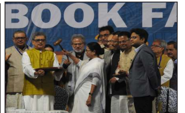
Chief Minister Mamata Banerjee inaugurated the 46th International Kolkata Book Fair in Salt Lake on Jan 30.