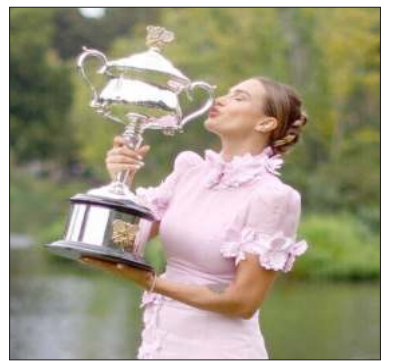
stage, as she dropped her sports psychologist in pre-season.

MELBOURNE: Aryna Sabalenka bludgeoned her way to a maiden Grand Slam title at the Australian Open with a 4-6, 6-3, 6-4 win over Kazakh Elena Rybakina on Saturday in a thrilling final between two of the most exciting power-hitters in the women's game. Sabalenka's 11th straight win of the year will propel the Belarusian fifth seed back to her career-high ranking of number two behind Iga Swiatek as she reaps the rewards of her improved mental stability. Success has followed a period of introspection and change for Sabalenka, who had often appeared to let her emotions halt her progress on the big