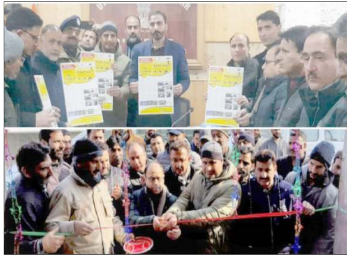
The event witnessed huge participation of volunteers including the officials of MVD department besides representatives of Taxi Operator Union, Drivers from various schools and volunteers of the Automobile dealers donated blood in the camp.