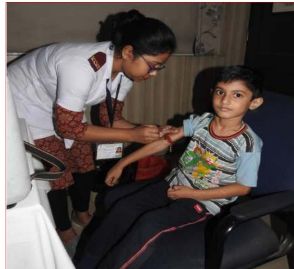
Children between 9 months to 15 years' give a dose of the measles-rubella (MR) vaccine program at Kolkata Press club, January 16, 2023.