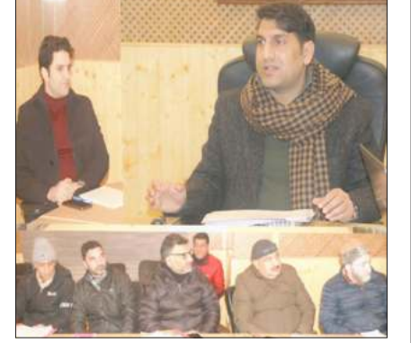
sure implementation of NMMS App which permits real time attendance of workers at Mahatma Gandhi NREGA worksites along with geo-tagged photographs, which aims at bringing more transparency and ensuring proper monitoring of the schemes.