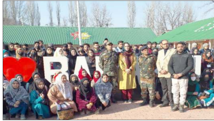
She said that several initiatives are being taken by the district administration which aims to provide a conducive and suitable environment for the young entrepreneurs so that they can become job providers rather than job seekers. Urging the youth to come forward

On the occasion, the DC interacted with the trainees and enquired about different facilities and amenities that are provided to them. During the interaction, the trainees shared their on ground exposure with which they are being acquainted. Meanwhile, the instructors of the vocational club apprised the DC about different programmes and courses currently being imparted to the enthusiastic aspirants of the district. After taking a thorough inspection, the DC complimented the young aspirants who are currently enrolled in the club and said that upscaling skill development among our youth have been one of the top most priority of the present dispensation.