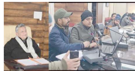
ADBHU Doda portal and was also aired live on the Facebook page of District Administration Doda and from other social media platforms.

The day-long training for usage of online services of various departments was hosted through the