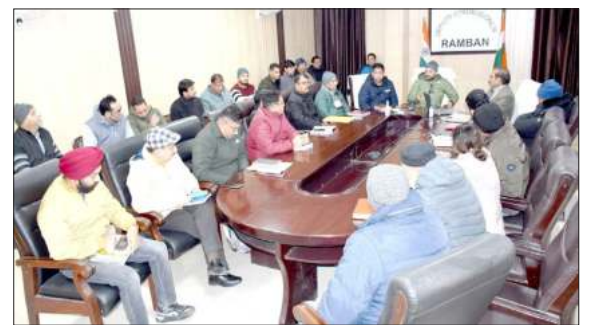
The meeting held threadbare discussion on identified indicators, effective mechanism for timely collection of data and meeting other aspects of APDP.

A detailed discussion was held on the parameters pertaining under different categories including availability of basic infrastructure, environment conservation, Governance, skill development and other activities proposed for the designated panchayats.