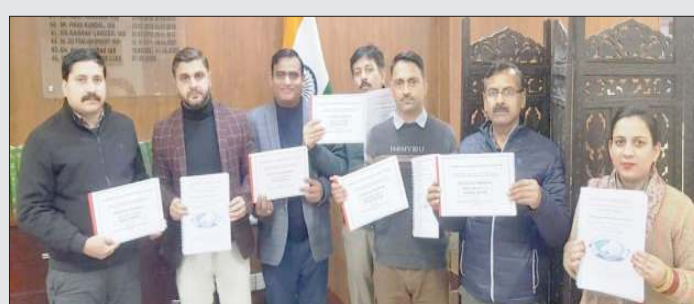
farmers. He asked the Fisheries Department to utilize the study for widening the scope of the coverage of the PMMSY scheme in the district. "The data con-

While highlighting the findings of the study, the DC expressed hope that the suggestions/recommendations such as opening of more departmental outlets at block and district level will facilitate the marketing, cold storage and transportation and making available the feed/seed of trout fish to the fish rearing