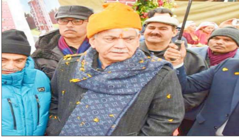
Accommodations for Migrant Kashmiri Pandits working under Prime Minister's Reconstruction CONTINUED ON PAGE 07

Srinagar, Jan 20: Jammu and Kashmir's Lieutenant Governor Manoj Sinha Friday said that all the security arrangements are in place for the Bharat Jodo Yatra and the administration will facilitate it smoothly. He reiterated that those who misused powers to grab state land will face action and that the poor and common masses need not be afraid of the ongoing drive.