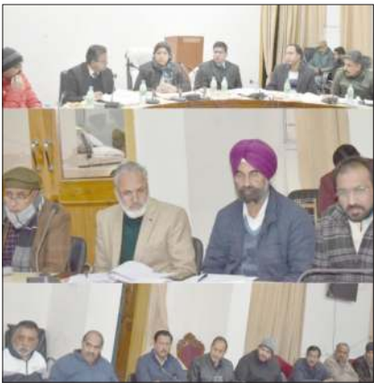
stakeholders to look into the issues discussed in the meeting and take appropriate measures to resolve the same. The meeting held detailed deliberations on a number of issues, including meeting the infrastructural requirements of judicial institutions.