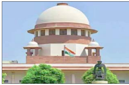
them orally not to demolish any houses. But we will not grant a general stay. Others should not get benefit," the bench CONTINUED ON PAGE 07

Srinagar, Jan 20: The Supreme Court of India on Friday refused to stay a circular issued by Jammu & Kashmir government directing deputy commissioners to remove encroachments on State land including Roshni land and Kachharie land by January 31.