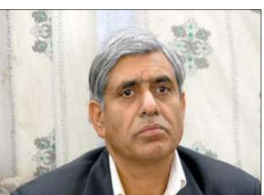
result in making thousands of people homeless and landless. "This policy was drafted and executed in hurry which invited criticism and suggestions from different sections of the society. Instead of a blanket order, it was imperative for the government to assess and differentiate between