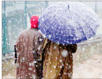
spread places till January 22nd. The officials further informed that with CONTINUED ON PAGE 07

Srinagar, Jan 19: The parts of Kashmir Valley including Srinagar received light snowfall in the intervening night of Wednesday-Thursday while the weatherman here has predicted cloudy weather conditions till January 22 and light to moderate snowfall across the Valley from January 23. People in Srinagar and elsewhere woke to a thin layer of snow this morning. The officials in the Meteorological department told the news agency—said that the weather conditions would remain generally cloudy with chances of light to moderate snow or rains in plains of Jammu over scattered to fairly wide-