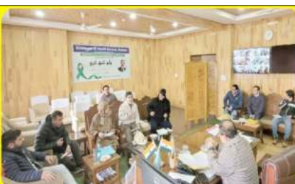
all arrangements for the pilgrims along the way. He directed the officials to explore the possibility of setting up of mini intensive care cells to handle emergency cases. He further directed Principal RIH-FW Dhobiwan to arrange special training programs for health care workers with special emphasis on modern gadgets to tackle emergency cases during .