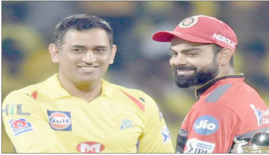
Team India between 2008 and 2019.

Kohli shared the dressing room with Dhoni for 11 years during their stint with