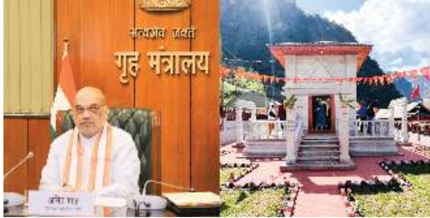
Narendra Modi-led Central government centers for the revival of the culture is renovating many temples and faith Turn.....Peace Is Being.....Pg 02

The Centre abrogated Article 370 and 35(A) from the erstwhile state on August 5, 2019. Jammu and Kashmir was bifurcated into two Union territories of Jammu and Kashmir and Ladakh on the same day. Shah mentioned that Prime Minister