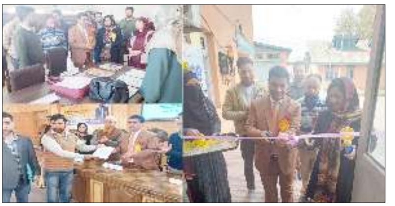
etc. participated in the event. Resource Persons from government line depart-

Around 22 Private Companies and Skill Development Organisations operating in varied sectors and fields including M/S Zaydaan Renewable Energy Pvt. Ltd, M/S Dominos Pizza, M/SWishfin Pvt. Ltd, M/S Continental Heating and Air conditioning system, M/S R.S Profiling Pvt. Ltd, M/S ALBA Power Pvt. Ltd, M/S Hotel Four Points by Sheraton, M/S Janta Joinery, M/S DG Power Systems, LIC, Himalayan Motors, Mahindra Shuhul, Amco Automobiles, M/S Rooman Technologies