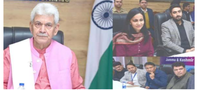
Lt Governor interacts with citizens who had filed their complaints on JKIGRAMS; several cases disposed on the spot

JAMMU, FEBRUARY 28: Lieutenant Governor Shri Manoj Sinha today interacted with citizens, who had filed their complaints on JKIGRAMS, during the "LG's Mulaqaat- Live Public Grievance Hearing" at the Civil Secretariat. During the public hearing, several cases were disposed of on the spot for which the applicants expressed their gratitude to the Lt Governor. The Lt Governor directed the officials to safeguard the interests of the common citizens and ensure that the grievances are attended promptly. "JKIGRAMS complaint mechanism is serving a range of objectives including feedback