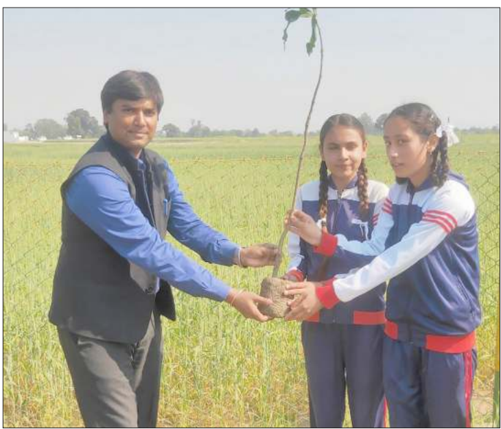
on the occasion.