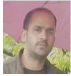
By M S Nazki

Remember the date 22/03/2023 and that is the day of the first Navratra!