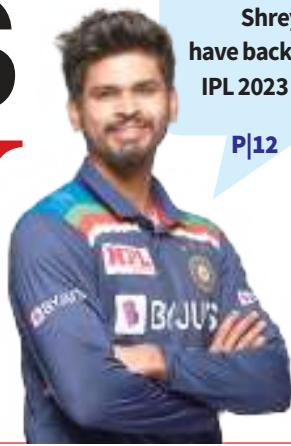
Shreyas Iyer to have back surgery, out of IPL 2023 and WTC final