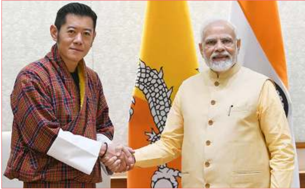
Partnership with India is deeply appreciated.

On Monday evening, Mr Jaishankar called on the visiting dignitary and said the King's vision for Bhutan's future and for strengthening the unique part-