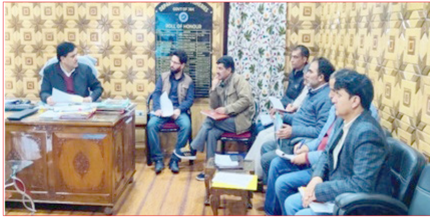
under UT CAPEX/ PMMSY Trout Raceways, Carp Ponds, Large RAS (water efficient technology), Medium RAS, Biofloc, Feed Mill and Trout Hatchery.

cers of Kashmir Division. During the meeting, the Director reviewed the achievements made during the year 2022-23 under various schemes both in CAPEX and CSS/PMMSY. He expressed satisfaction on the progress made by the Department and emphasized on the need to continue the momentum. Director Fisheries highlighted the major achievements of the Department, in Kashmir Division achieved during the year 2022-23 which includes