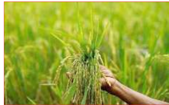
Additional Chief Secretary, Agriculture Production Department, Atal Dulloo, emphasized that the proposed project will be segmented into several key areas. These included market reforms, infrastructure development, institutional and capacity building, branding, digital marketing, and market

remains in integrating smallholder produce with market systems that are both effective and transparent. This will ensure that farmers receive a fair price for their goods while consumers get good value for their money. To tackle this issue, Jammu and Kashmir is implementing a project under Holistic Agricultural Development Program (HADP) that aims to strengthen the existing market infrastructure and create a robust market ecosystem that caters to the needs of all stakeholders.