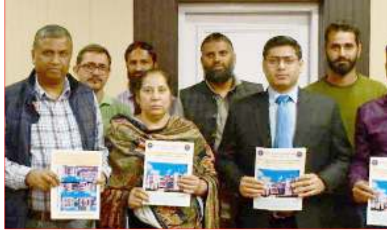
information about the admission process, eligibility criteria, and fee structure. Interested parents and guardians can obtain a copy of the prospectus

The Eklavya Model Residential School is affiliated with the Central Board of Secondary Education (CBSE) and offers education from class VI to XII. The prospectus contains detailed