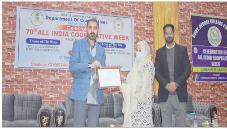
tion of new avenues for cooperatives to thrive.

Addressing the diverse gathering, the DC expressed his pleasure at witnessing such a vibrant assembly. Emphasizing the theme, he articulated the critical role of cooperatives in uplifting the local economy. He underscored the need for continuous innovation, adaptability, and exploration of new avenues for cooperatives to thrive.