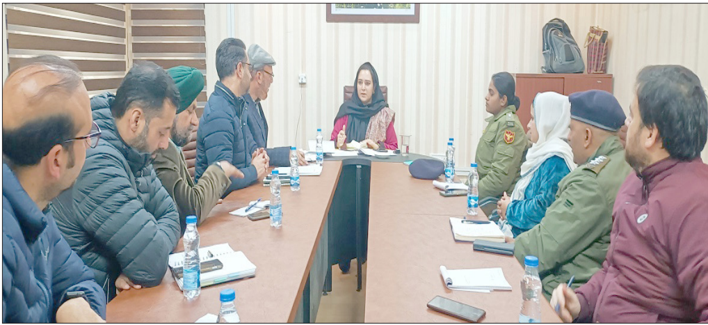
Regional Transport Officer (ARTO) has been directed to for-

The DC further issued directives to the concerned departments during the meeting to work in a coordinated and cohesive manner. The Assistant