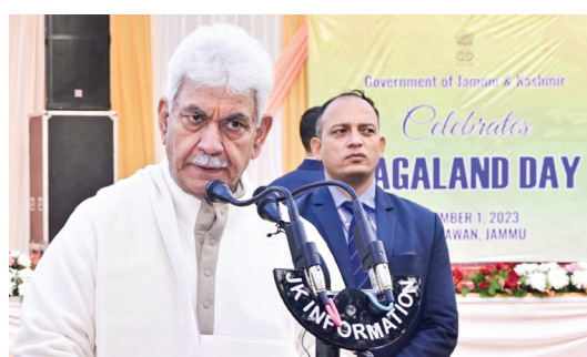
Shreshtha Bharat, the Nagaland Statehood Day

JAMMU, DEC 01: Fostering the spirit of Ek Bharat