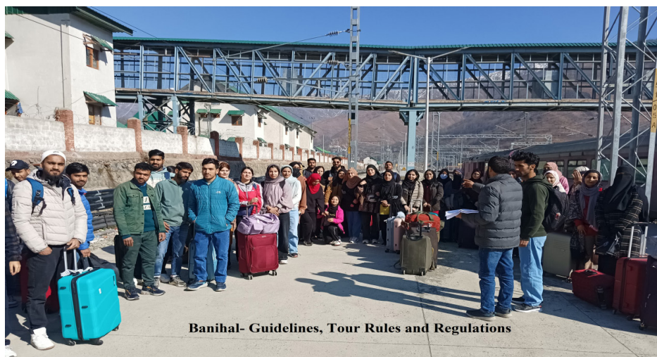
Banihal- Guidelines, Tour Rules and Regulations

respected educational institutes. There are different educational techniques by which educators deliver the lessons to the students; organizing an educational tour is one of them. Educational tours play an important role in educating students in a practical and interesting manner. It is a fun and pleasant time while travelling from one city to another with your classmates and friends. It allows students to witness things from a fresh perspective while trying to learn more about new situations in an informal environment. Many colleges as well as Schools nowadays are following the practice of educational tours so that students can learn more effectively. The benefits of educational tours are explained below: (i) Interactive