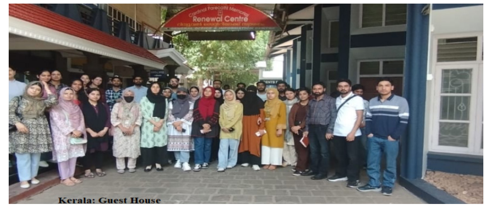
Kerala: Guest House

students can interact with other people from all sections of society. It gives them a chance to gain new perspectives, and learn from complete strangers with unbiased opinions. (iv) New Experiences: Many students do not get to experience the typical trip locations with their families. Because of money constraints or lack of resources, not all parents are able to take their kids to zoos, museums and other field trip destinations. An educational trip gives the opportunity for students to experience new venues or places. Moreover, when students and teachers are together going on a trip, new educational environments and experiences are possible. Students may have the opportunity to observe many