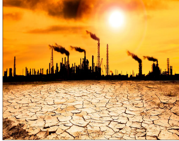
Saulo warned in a statement.

"Never have we been so close... to the 1.5C lower limit of the Paris Agreement," WMO chief Andrea Celeste