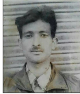
By Mool Raj

However, as Ladakh prepares for the upcoming Lok Sabha polls, it is imperative to ensure that such demonstrations of solidarity do not impede the electoral process. Balancing the pursuit of political rights with the need for smooth electoral functioning is crucial in upholding democratic values and ensuring inclusive representation for all citizens of Ladakh.