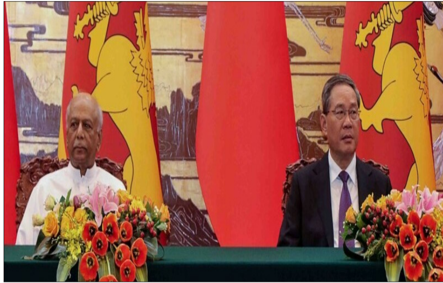
Months of protests forced then-president Gotabaya Rajapaksa out of office. Gunawardena's office said Premier Li

Sri Lanka in 2022 ran out of foreign exchange to finance essential imports and declared a sovereign default on its $46 billion foreign debt.