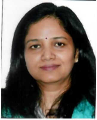
By Ms. Neetu Prasad

The ocean's wonder plant with untapped economic potential