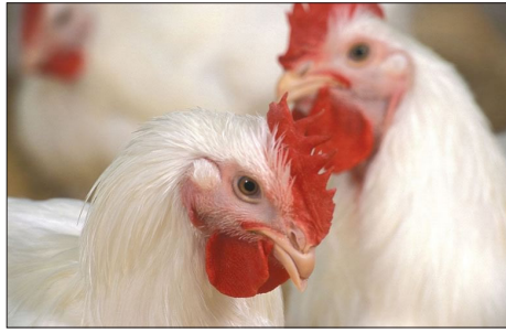
"This appears to be 100 times worse than COVID — or it could be if it mutates and maintains its high case fatality rate," he said. "Once it's mutated to infect humans, we can only hope that the [fatality rate] drops." Around 52 per cent of humans who have