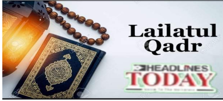
Night of Al-Qadr (Decree). 2. And what will make you know what the Night of Al-Qadr (Decree) is? 3. The Night of Al-Qadr (Decree) is better than a thousand months

(peace be upon him). It is a night of profound blessings and mercy, wherein the worship of Allah is more rewarding than a thousand months. In the words of the Prophet Muhammad (peace be upon him), "Whoever spends this night in prayer out of faith and in the hope of reward will be forgiven his previous sins." (Narrated by al-Bukhari, 1901; Muslim, 760). The significance of Lailat-ul-Qadr is beautifully encapsulated in the Quranic verse from Surah Al-Qadr (97:1-5), where Allah declares: "Verily, We have sent it (this Quran) down in the