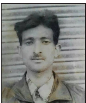
■ By Mool Raj

The first five years of a child's life are termed 'golden period,' a pivotal phase where parents play a monumental role in shaping its future