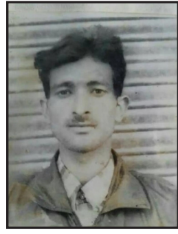
By Mool Raj

The people in general hail the government scheme of improving the infrastructure, but they want the things to be done in a quick manner. The scheme needs to be expedited so that aggregate and technical commercial losses are minimized. This will also ensure that smart power system is in place and the round the clock power supply will become a reality in Jammu & Kashmir.