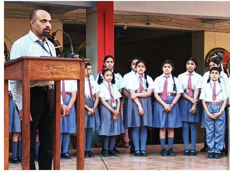
various aspects of prevention and control of malaria. The State Malariologist addressed an

web conference of National Centre for Vector Borne Disease Control in collaboration with WHO. At the National level, the Nodal Officer of the Provincial Hospital Gandhinagar Jammu participated in a one day technical workshop on elimination of Malaria targeted by 2027. The IEC activities included publishing of IEC material in leading UT and local newspapers. The information was also spread through TV interviews on Doordarshan Jammu and local channel(s). The awareness on Malaria was also spread through an interview and day long broadcast of audio -spot on Akashwani Jammu and FM radio channels, educating the people about