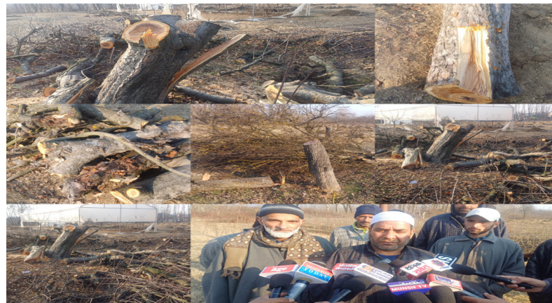
schemes have been inaugurated here, yet no details of their revenue or out-

"It is deeply concerning that over the last 20 years, numerous government