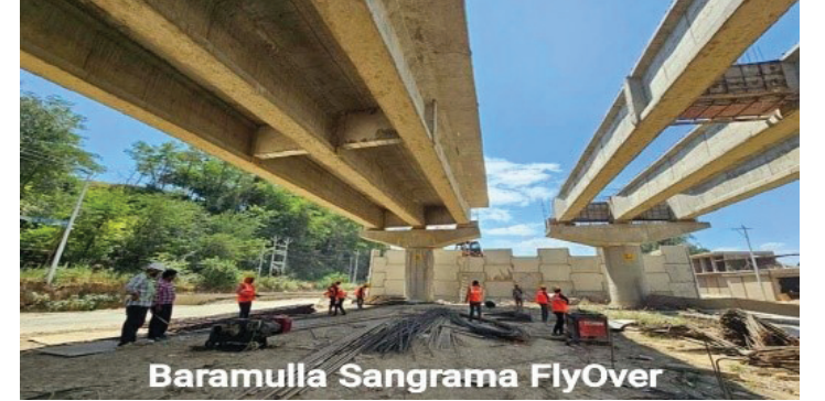
Baramulla Sangrama FlyOver