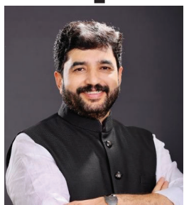
MURLIDHAR MOHOL UNION MINISTER OF STATE FOR COOPERATION AND CIVIL AVIATION

The recent International Cooperative Alliance (ICA) Global Cooperative Conference 2024 in New Delhi was more than just a spectacle of global gathering of leaders from over 100 countries; it was a testament to the growing importance of cooperatives in shaping a sustainable and equitable future. During the event, Prime Minister Shri Narendra Modi launched the United Nations' International Year of Cooperatives 2025 (IYC