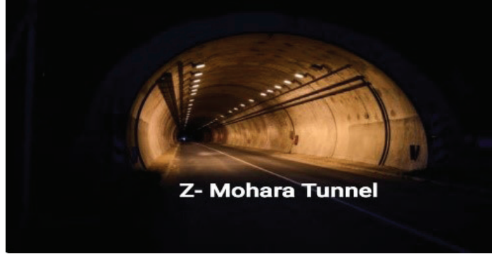
Z- Mohara Tunnel