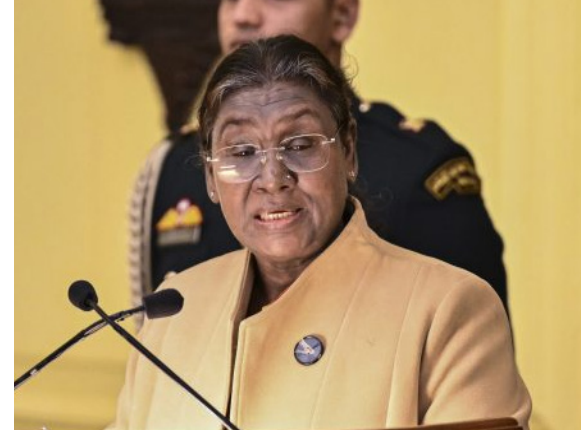
Murmu said it is their duty to collect accurate data, which can be the foundation for sound and objective decisions.

“Statistical analysis is a tool to bring in transparency and accountability in governance. Statistics is not only the backbone of efficient governance but also a tool for socio-economic development,” the president said.