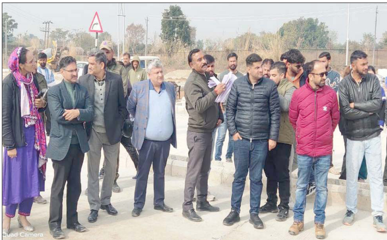
trained and tested in a realistic and modern setting. Once fully auto-

Transport Commissioner Vishesh Mahajan emphasized, "The initiative is a step towards creating safer roads by ensuring that license seekers are