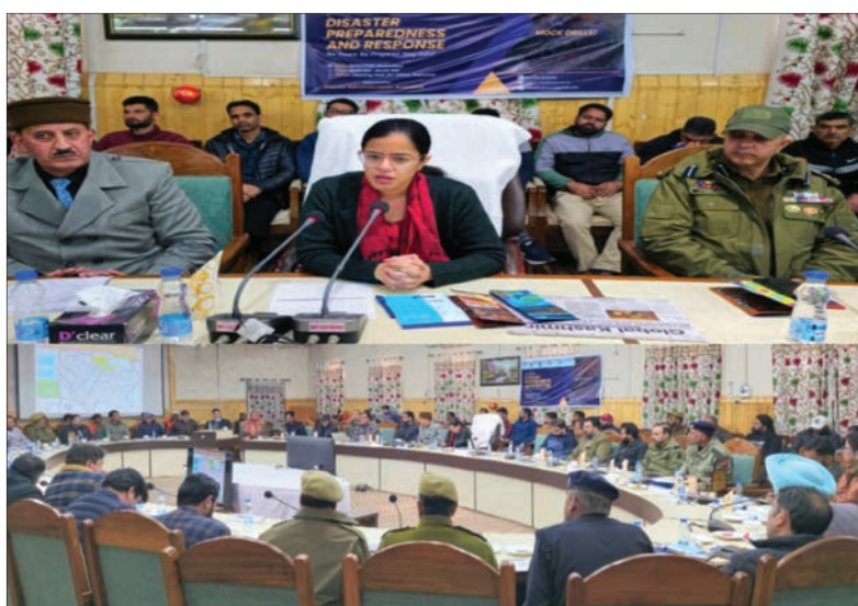
ard circumstances. Later, the officials and volunteers from SDRF, NDRF including Aapda Mitras provided detailed awareness

Meanwhile, experts and officers from different departments including SDRF presented their plan in the meeting for dealing with the untow-