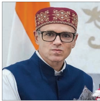
Minister Omar Abdullah would chair an important meeting of MLAs of the ruling alliance on