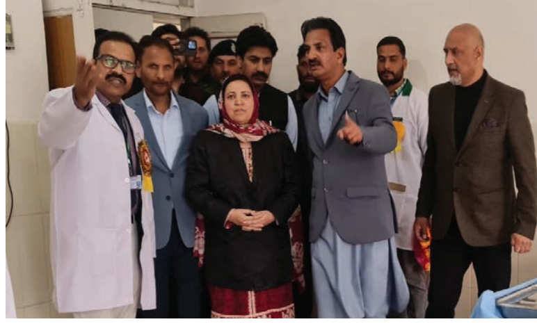
Later, the Minister visited the Primary Health Centre (PHC) Nowgam, assessing its operational efficiency, availability of medicines as well as

nied the Minister during the visit. While inspecting the Sub-District Hospital (SDH) Shangus, Sakeena took stock of medical services, availability of essential supplies and overall patient care at the facility. She engaged with the hospital staff and enquired about the overall healthcare delivery at the hospital. She assured them that necessary interventions would be made for infrastructural and other advanced medical care services at the facility to provide world-class healthcare facilities to the public. The Minister also interacted with the patients and had on-spot feedback from them about the services being provided at the hospital.